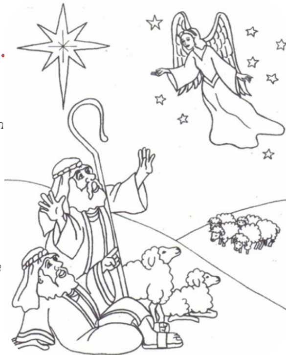
An angel of the Lord appeared to them and said, "Don't be afraid. I bring good news!"

How can you tell others about the joy that Jesus has brought your family? Color in the candle of Joy and open the envelopes on your Advent calendar.