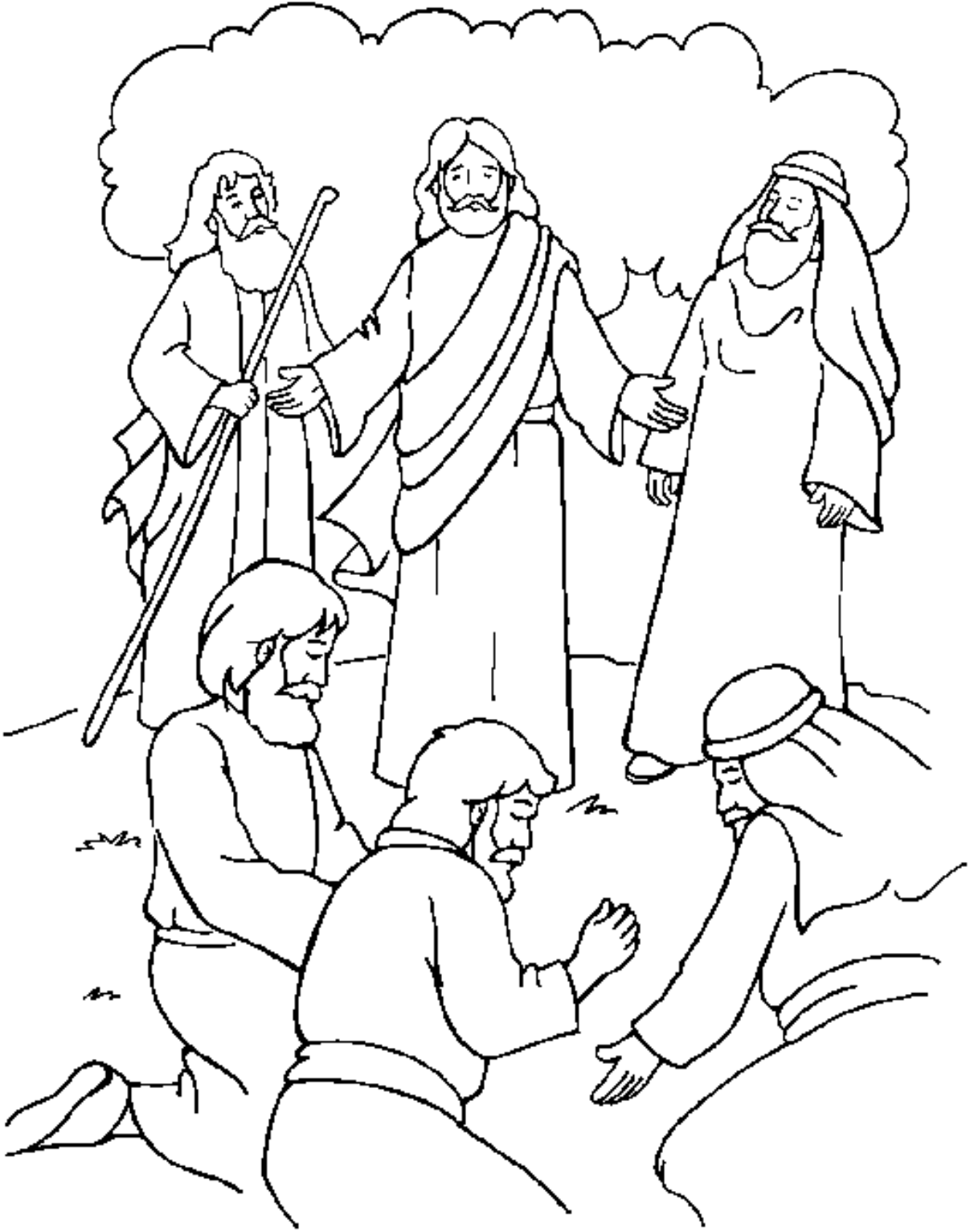
The Mount of Transfiguration Mark 9:2-9