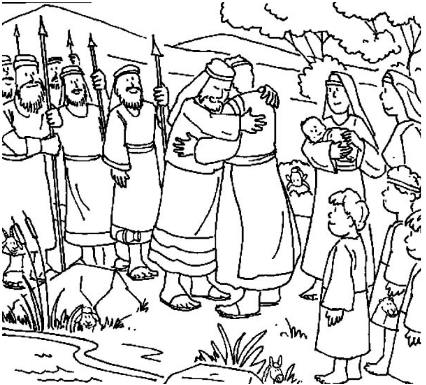
Jacob and Esau reunite