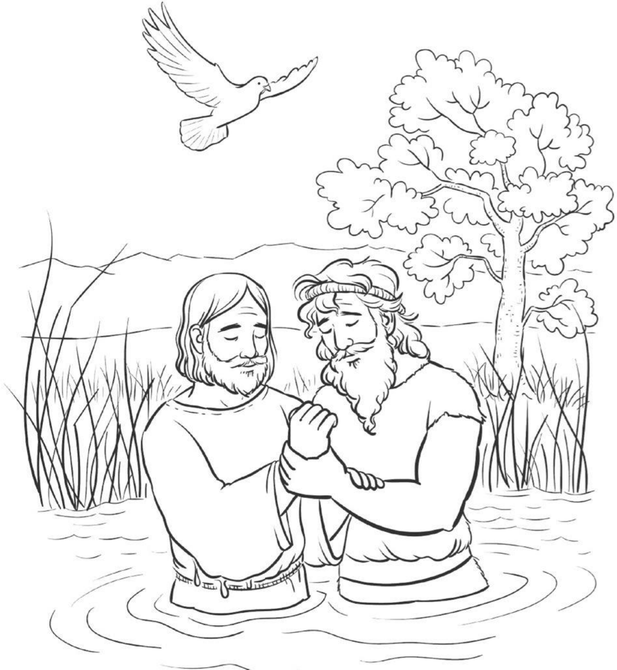
ILLUSTRATION BY APRIL STOTT